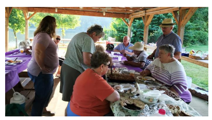
Everyone who attended the picnic enjoyed the food and fellowship despite the heat. Some canine and feline visitors attended the event with their owners.