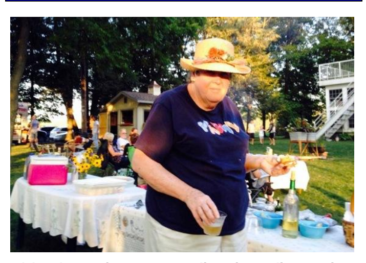
A lovely evening was spent listening to live music, catching up on the latest news, enjoying a glass of wine and sampling lots of tasty snacks on the lawn of the Juniata Valley Winery near Mifflin, PA.