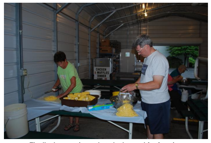
Finally the corn is ready to be bagged for freezing

Rained Out! The planned picnic cruise on the Millersburg Ferry in July was the victim of one of this summer's frequent storms. The venue was quickly changed to the Grange Hall Conference Room and about 25 people enjoyed a meal together followed by conversation and some table games planned by Peg Bolton.