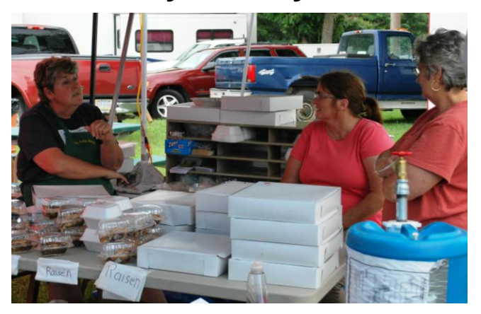
Part of the Grange's responsibility for the Lodge steak dinner stand at the Perry County Fair was the baking and serving of homemade pie – about 100 pies were consumed during the week. Proceeds were shared between the two organizations.