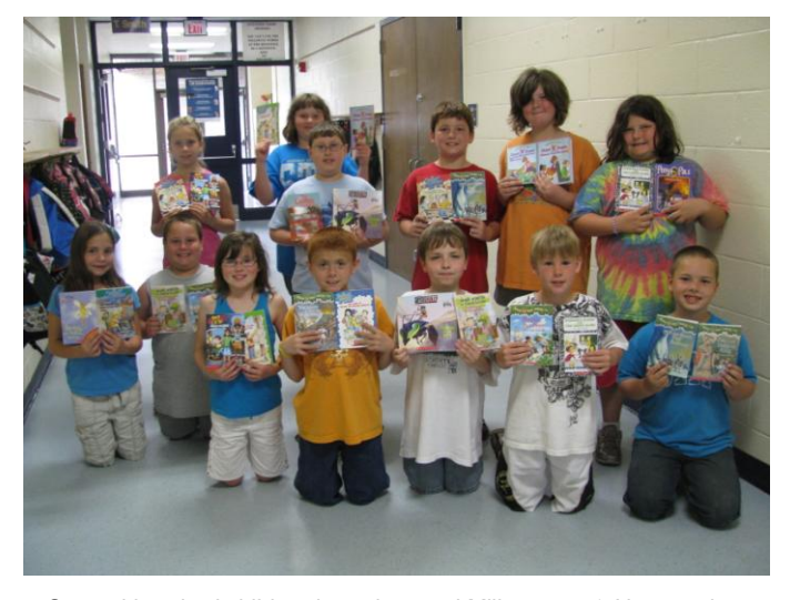
Several hundred children in and around Millerstown & Newport have received free books purchased with $500 provided by the Grange . The books were distributed through local summer reading programs at the Newport Public Library and the Greenwood School District.

Homemade Soup for the Newport Public Library Bike Ride – Sept. 24th About 50 quarts of assorted homemade soups (chicken corn, beef vegetable and ham bean) have already been made and frozen to feed the many riders who will raise thousands of dollars to support the library. This donation is in addition to our annual purchase of children's books for the library reading program.