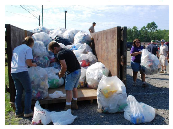
The Grange helped staff the Millerstown Recycling program on the last Saturday of July and then provided a free breakfast at the Grange Hall to all the volunteers.