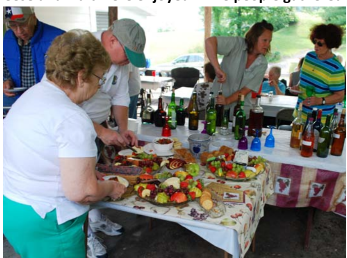
The program was about making homemade wine

Wine, cheese and fruit were enjoyed while people gathered