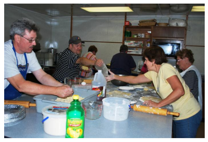
170+ homemade apple dumplings were made and donated to the Millerstown Area Community Park for their annual Fall Fest in September.