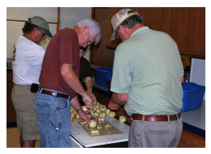
Paring & Coring the Apples