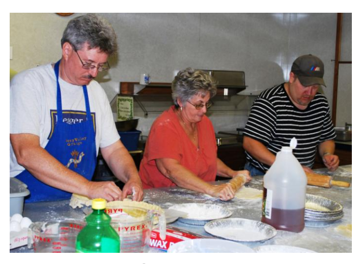
Rolling the Dough