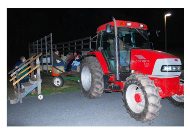
After a game of Harvest Bingo and the distribution of door prizes, members and friends were invited to enjoy a multi-generational hayride.