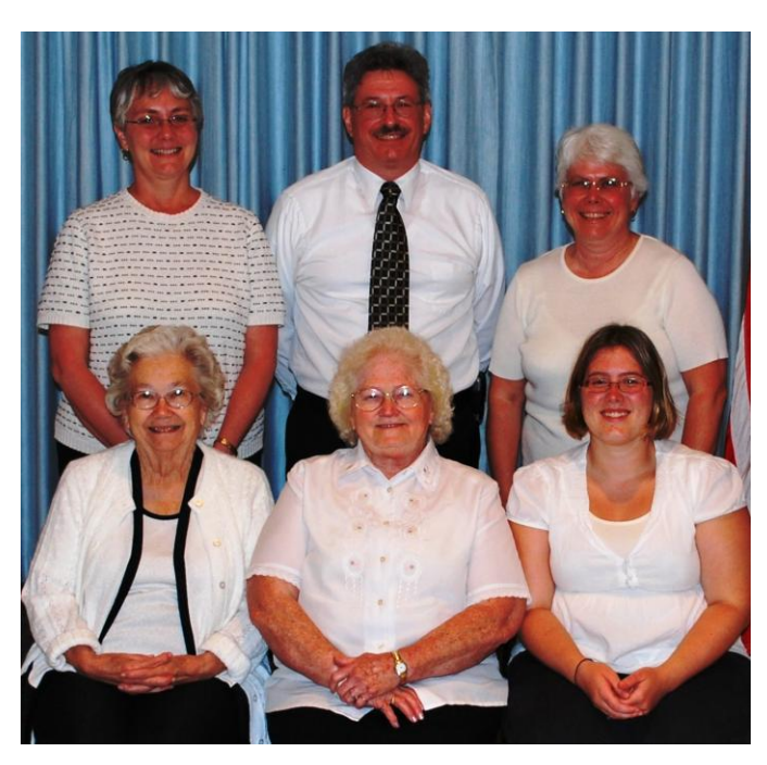
Installation Team Members