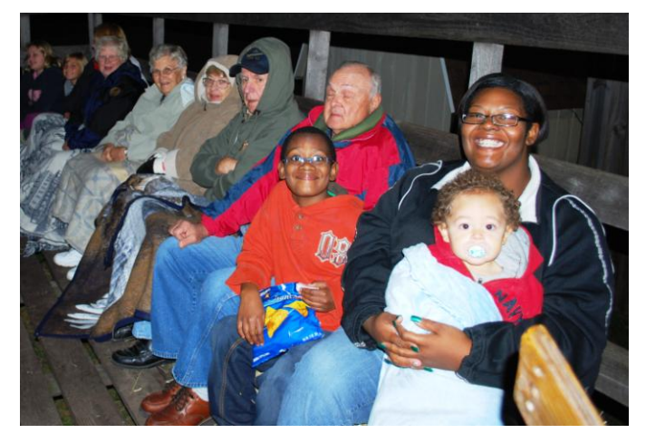
There was just a bit of nip in the air that evening, so everyone bundled up as they eagerly anticipated the wagon's departure.