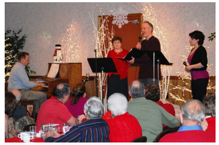
The entertaining musical variety program & door prizes were big hits with our 170 guests.

The kitchen was a busy place as chowder & salads are prepared for the "Seafood and Sirloin" dinner.