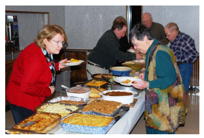
Plenty of delicious food greets everyone at our Grange fellowship dinners held prior to many meetings. Thanks to the Social Committees that make this all possible.

* Indicates some years of membership in Grange(s) other than Perry Valley