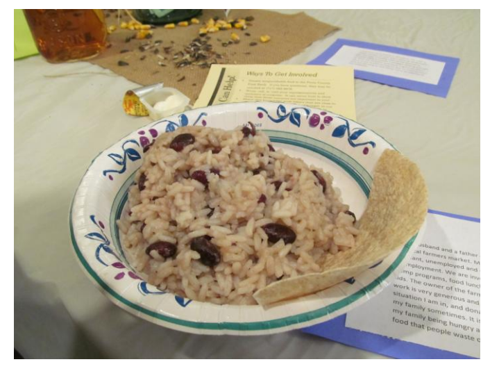
The Low Income Meal of Rice & Beans