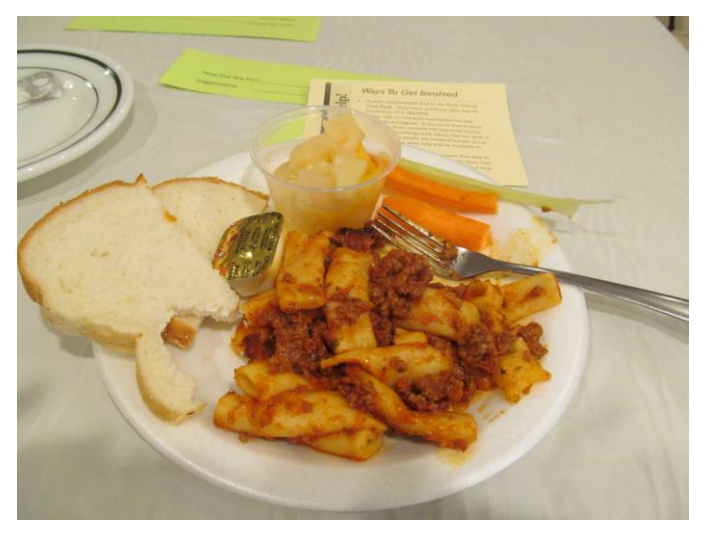
Pasta Served for the Middle Income Meal