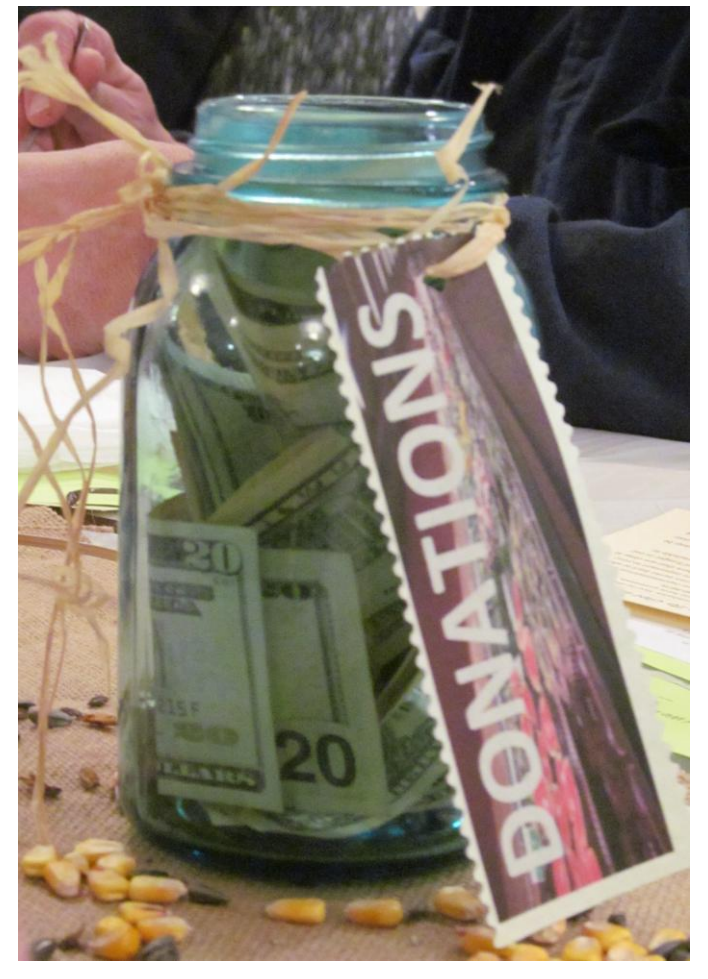
Approximately $1,000 was received help feed the hungry in Perry County