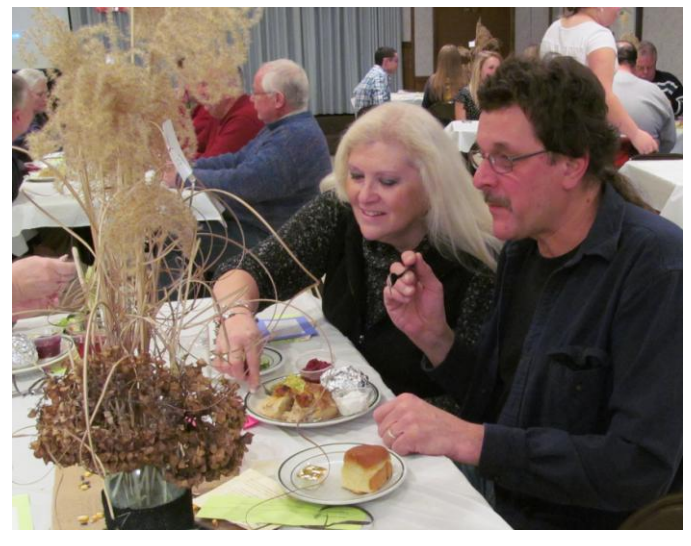
High Income Meals Shared with Less Fortunate