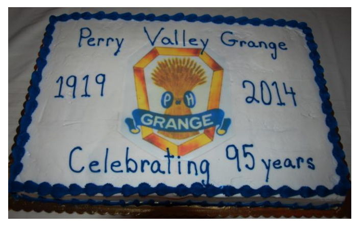
Perry Valley Grange was organized July 19, 1919, at Beaver' School. A 22-page historical booklet is available with details about the Grange's history.

The 95<sup>th</sup> anniversary of Perry Valley Grange was celebrated with a catered banquet and program on October 17<sup>th</sup>. More details on the Grange website @ www.perryvalleygrange.org.