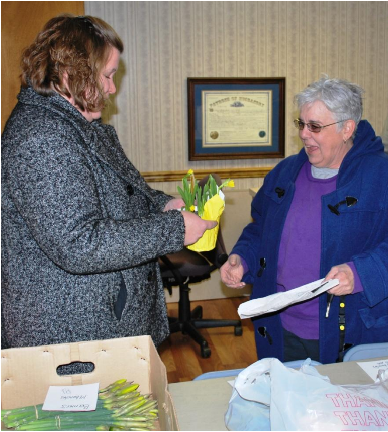
Grange Volunteers Support “Daffodil Days” to Benefit the American Cancer Society