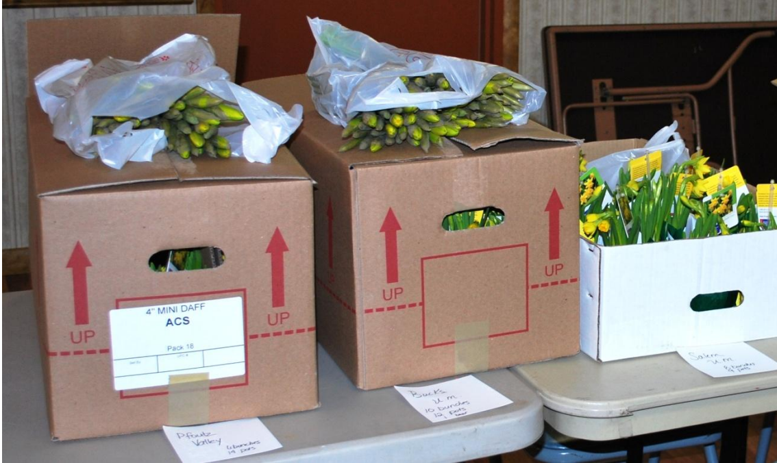
The various daffodil items are sorted at the Grange Hall, awaiting pick-up.