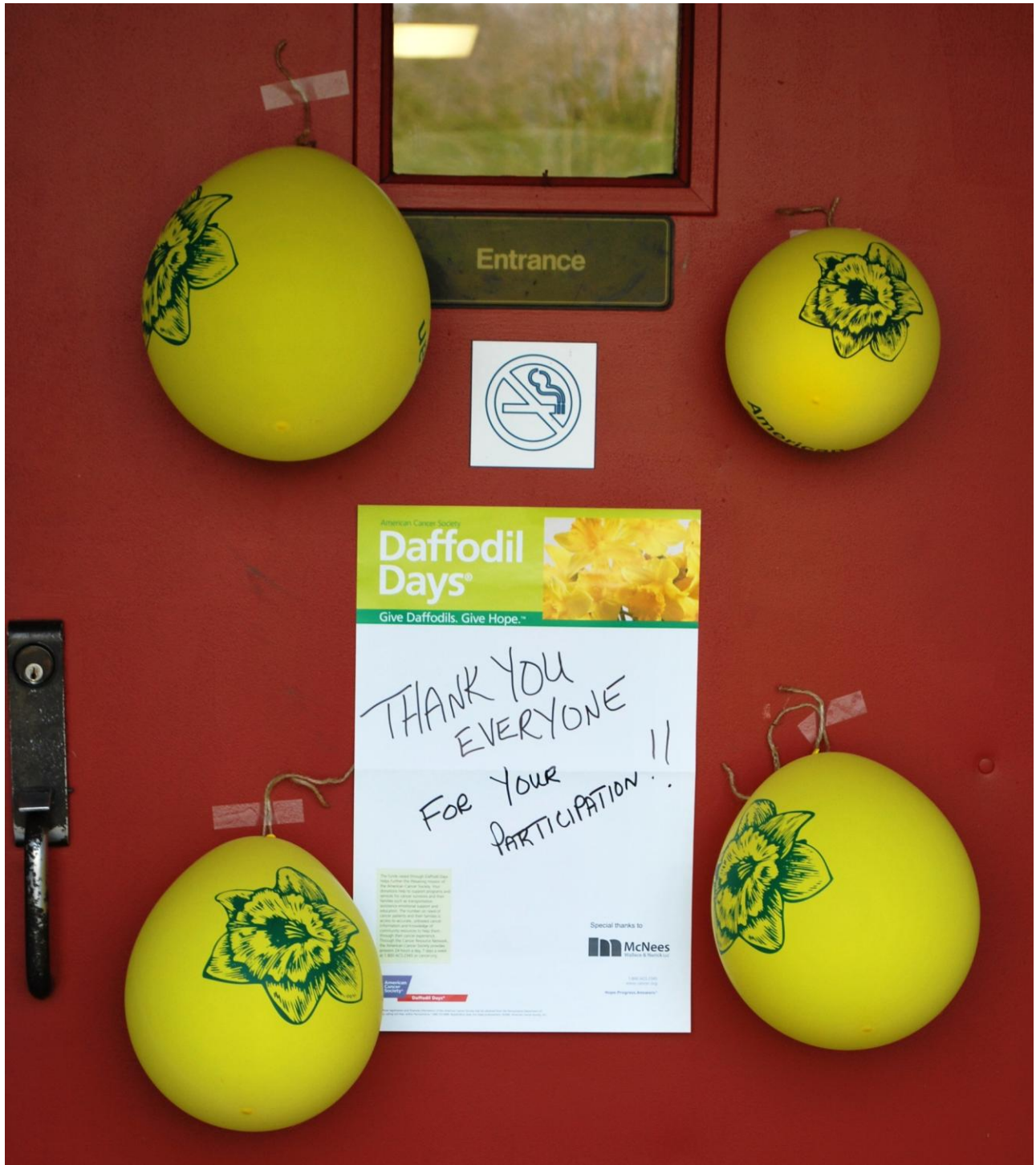
The door of the Grange Hall is decorated for the occasion as orders are filled inside.