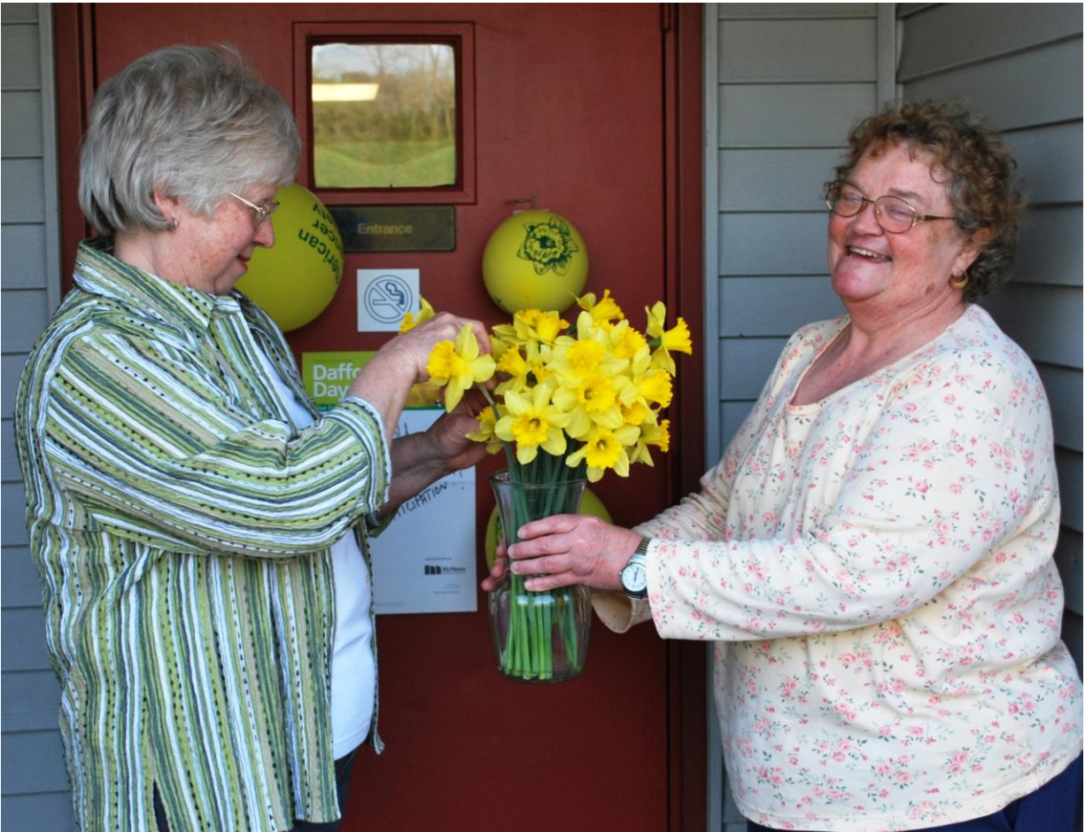
Grange Volunteers Support “Daffodil Days” to Benefit the American Cancer Society