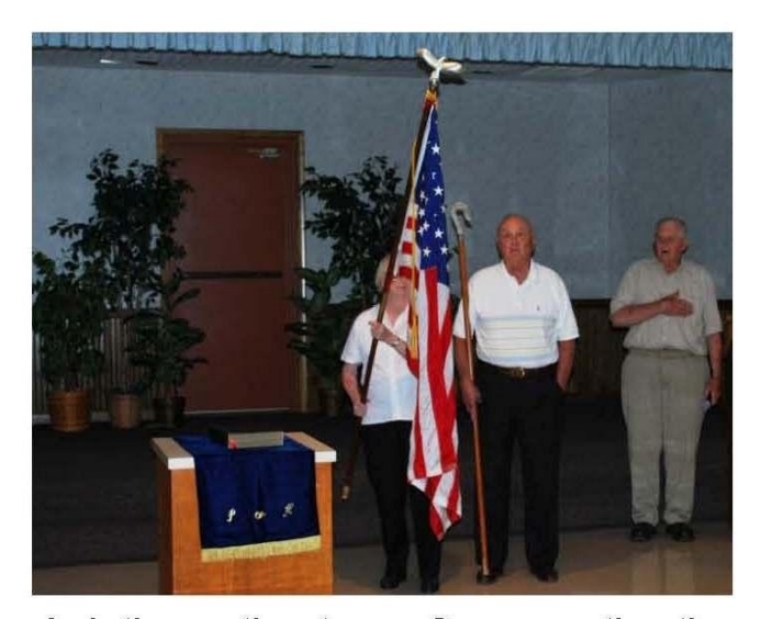
As is the practice at every Grange meeting, the American flag was presented and an opening prayer was given.