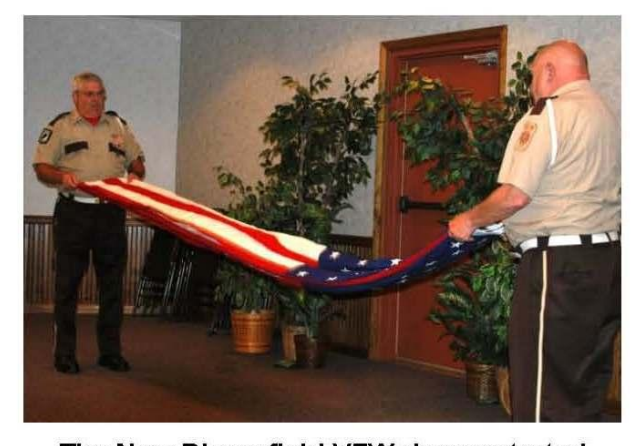
The New Bloomfield VFW demonstrated the flag folding ceremony that is done at funeral services of deceased veterans.