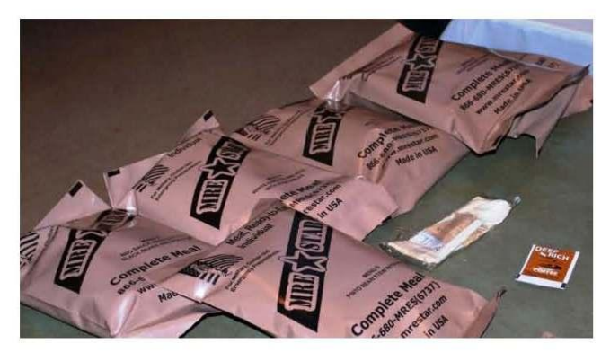
K-ration packets proved to be none-to-popular in comparison to all the delicious desserts.