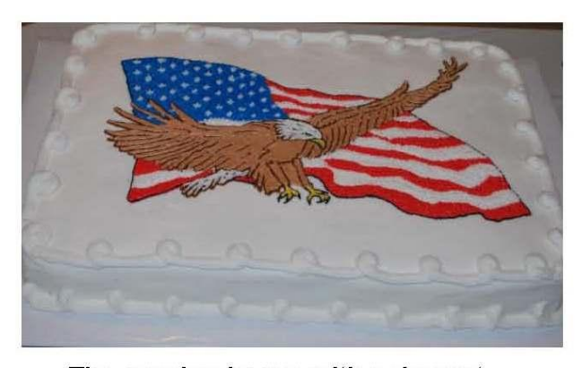
The evening began with a dessert reception, including a commemorative cake in honor of the veterans.