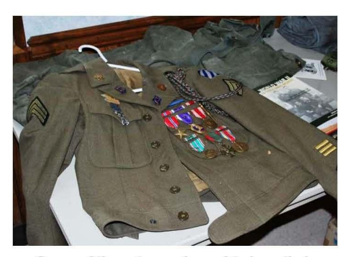
Some of the veterans brought along their uniforms and other military memorabilia to display and explain.