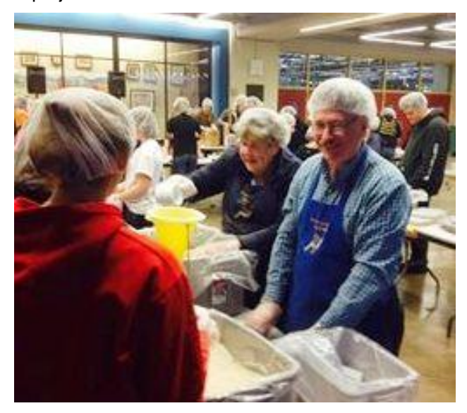
Grange volunteers wore colorful aprons that identified Perry Valley Grange as a supporter of Stop Hunger Now"

Several members of Perry Valley Grange traveled to the State Farm Show building to help DFFA members from Cumberland, Dauphin and Perry Counties pack 23,000 meals in just over two hours to help feed the hungry. This meal packing event was an immensely fun, handson and rewarding experience that provided life-saving food to needy people around the world. Stop Hunger Now meals are nutritiously sound. Every dehydrated/soy meal is fortified with 23 essential vitamins and nutrients. Research has shown that one in three people in developing countries are adversely affected by vitamin and mineral deficiency. The Grange contributed $250 to help the FFA chapters fund this project.