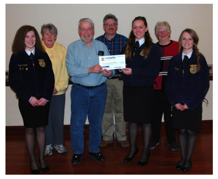
See Page 3 for more pictures and information about this big community service project.

FFA students and Grange members recently presented 2015 Hunger Banquet proceeds of $2,702.94 to the Perry County Food Bank to aid in fighting hunger in the local community.