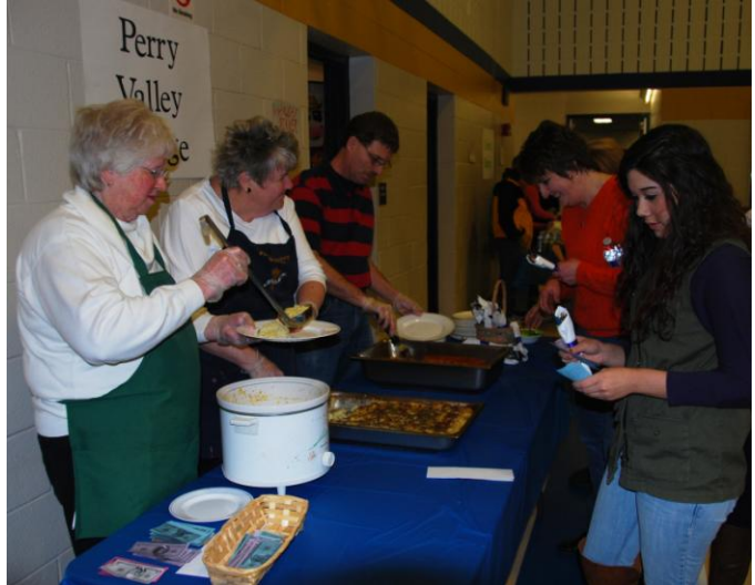
Perry Valley Grange offered a full course meal of ham loaf, scallopped potatoes and corn

The Grange and various churches of the community provided a variety of food items that could be "purchased" by each individual using their available "money".