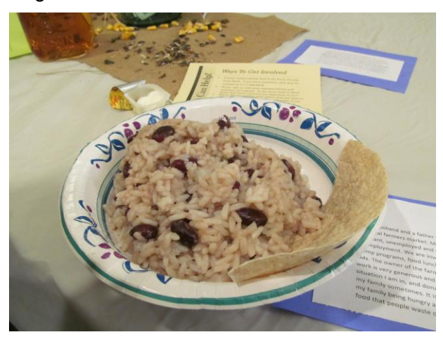
The Low Income Meal of Rice & Beans

Finally, those in the low-income group may have had only enough money to purchase a rather bland mixture of rice and beans, which incidentally is a major food staple for much of the world's population. As hoped, many tables of guests pooled their funds so that everyone could have enough resources to be fed.