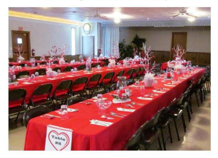
FFA Members help set table for the Gala