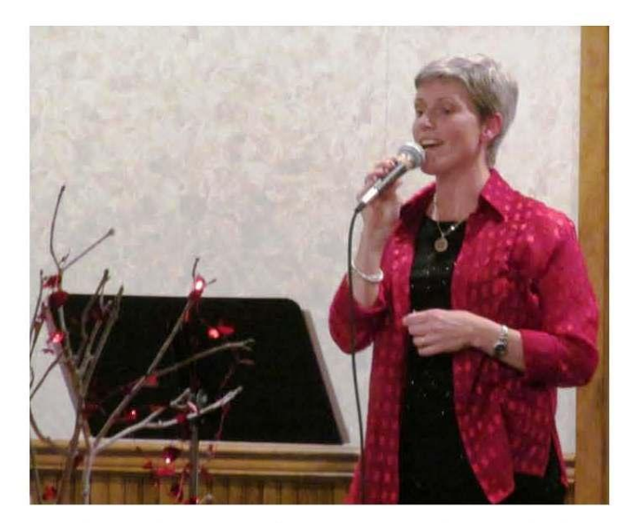
A "Broadway Revue" program was the evening's entertainment before the awarding of door prizes.