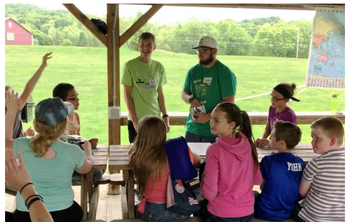
This station emphasized the importance of the dairy industry, complete with a young calf. At other stations, students had the opportunity to interact with animals including chickens and rabbits.