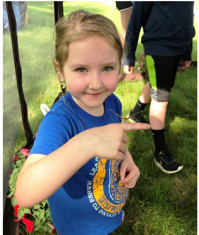
The butterfly tent was a popular learning station. Preparing for this required purchase of and caring for butterfly cocoons until the butterflies emerged.