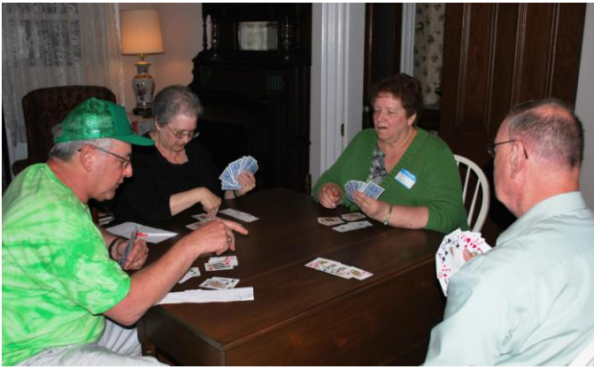
The pinochle players seem very intent their cards.