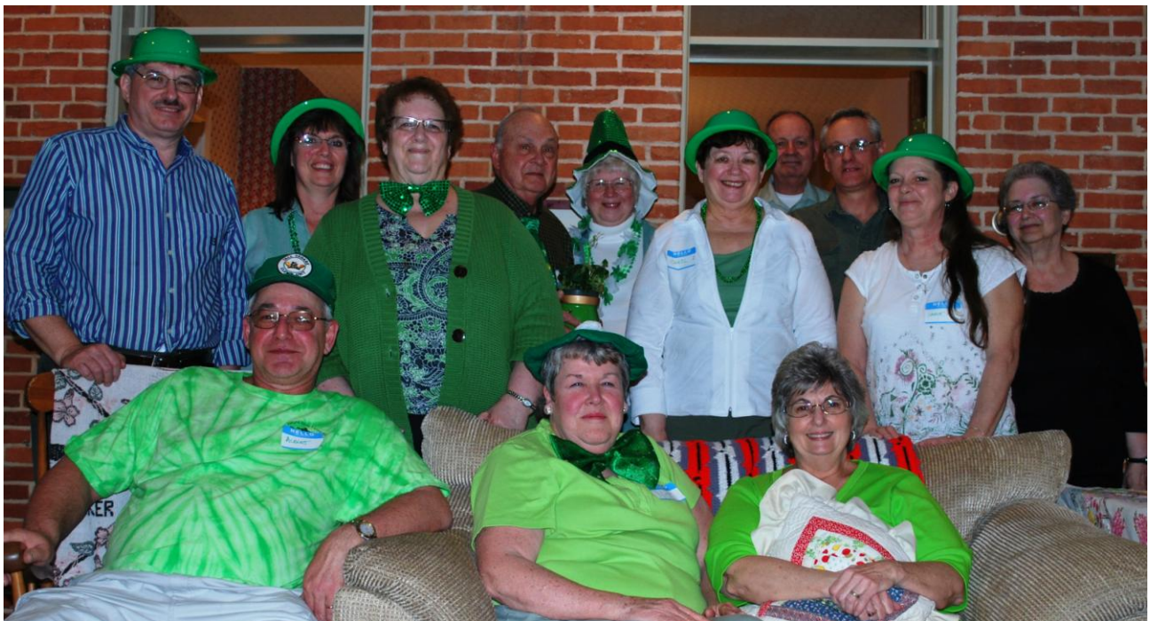
Smiling faces amid plenty of green brought the Grange St. Patrick's party to a close.