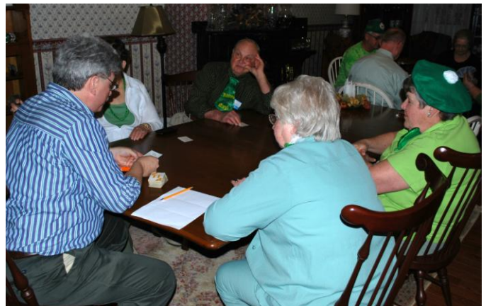
Table games for everyone were next on the agenda.