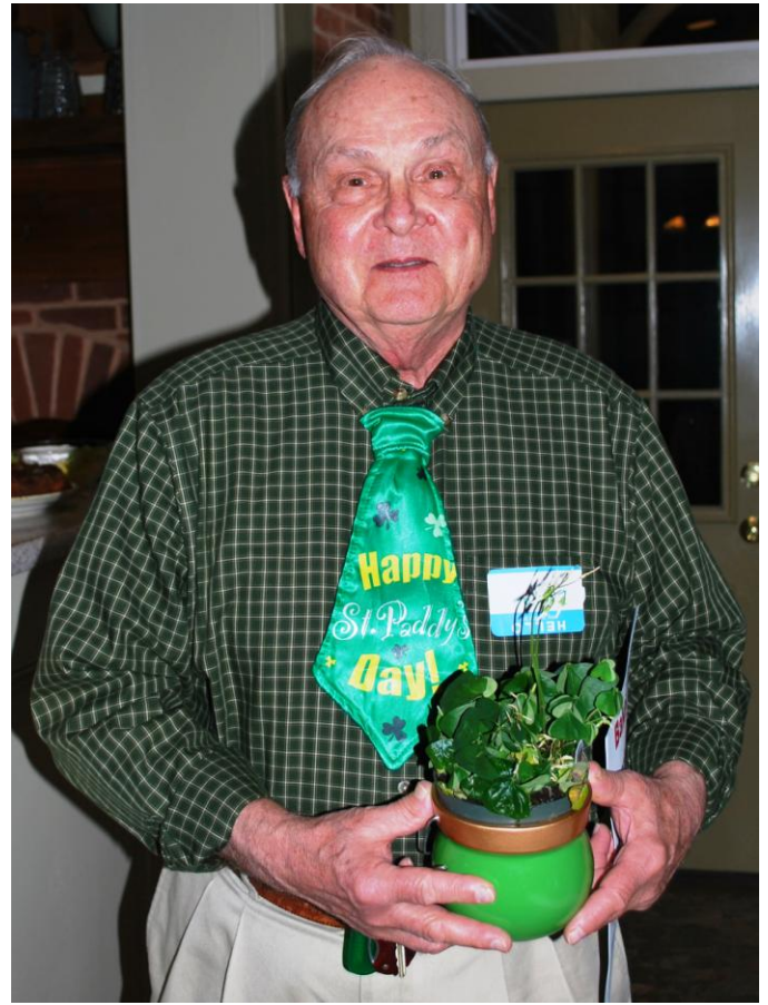
Everyone had the chance to vote for the best Irish "Wearing of the Green". This leprechaun received shamrocks, the traditional Celtic symbol of good luck.