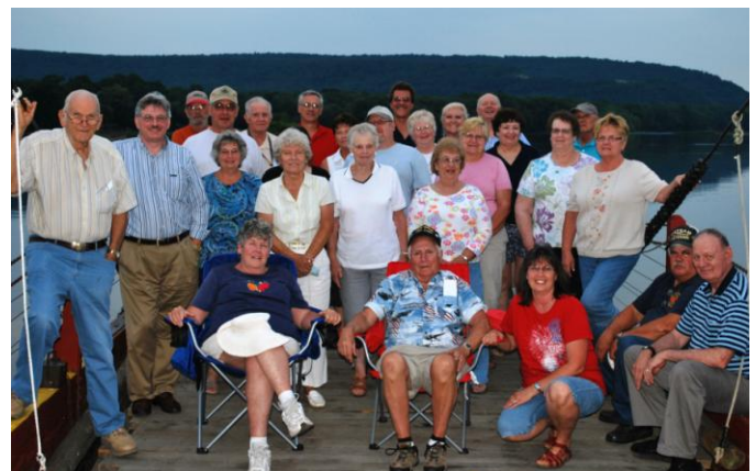
Grange members were joined by family, friends and some visitors from the Newport Lodge for a delightful evening of fun, food and fellowship on the water.

Truly, we reap what we sow. If you get involved, you'll enjoy being with others working toward a worthy goal. If you sit back and complain, you'll likely find yourself unhappy and alone.