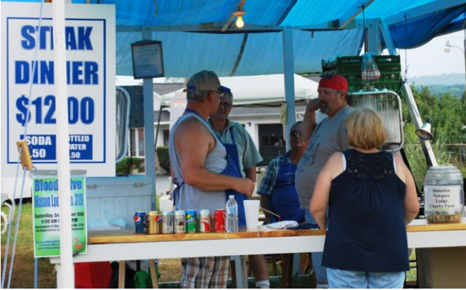
Our Grange members could be found working in the Pomona Grange Concession and the Lodge Steak Stand at the Perry County Fair.