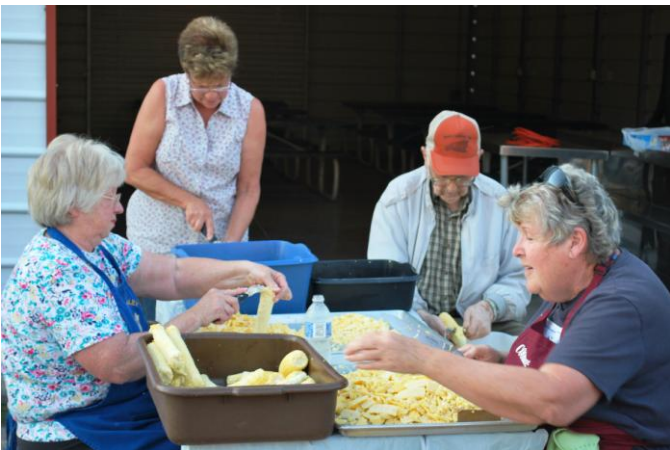
These and other volunteers prepared about 200 quarts of corn for freezing in just a few hours. On other days, 50 quarts of chow-chow and 80 pie crusts were made – all in preparation for the upcoming public dinner.