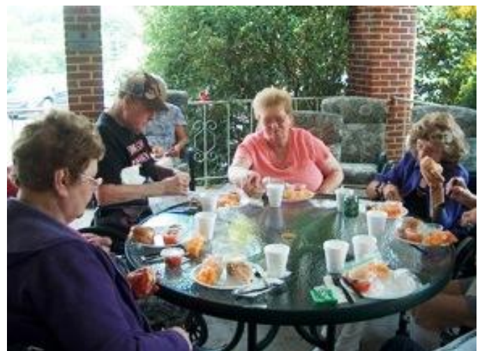
The Grange hosted a Patio Picnic with musical entertainment for the residents of Perry Village Nursing Home in late June.

Homemade Soup for the Newport Public Library Bike Ride – Sept. 29th The Grange has again been asked to make and donate about 50 quarts of chicken corn soup to feed the hungry participants in this annual fund raiser. This donation is in addition to our annual purchase of children's books for the library summer reading program.