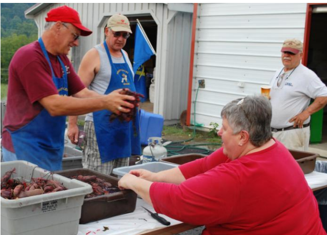
How about pickling several bushels of beets? Thanks to the generous donors for all this produce that will be served at upcoming dinners and banquets.