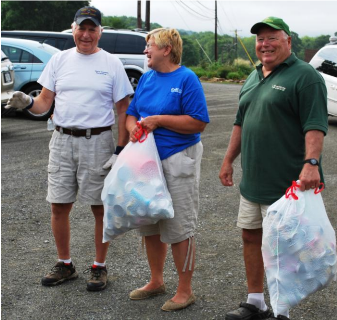
One would hardly think this was work from the big smiles on these volunteers' faces at the Millerstown Recycling program. Our Grange helped to staff the drop-off center on the last Saturday of July and then provided a free breakfast at the Grange Hall to all the volunteers.