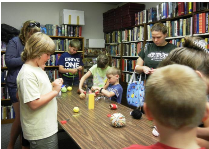
Children in and around Newport have received free books purchased with $250 provided by the Grange. The books were distributed through the summer reading programs at the Newport Public Library.

Homemade Soup for the Newport Public Library Bike Ride – Sept. 29th The Grange has again been asked to make and donate about 50 quarts of chicken corn soup to feed the hungry participants in this annual fund raiser. This donation is in addition to our annual purchase of children's books for the library summer reading program.