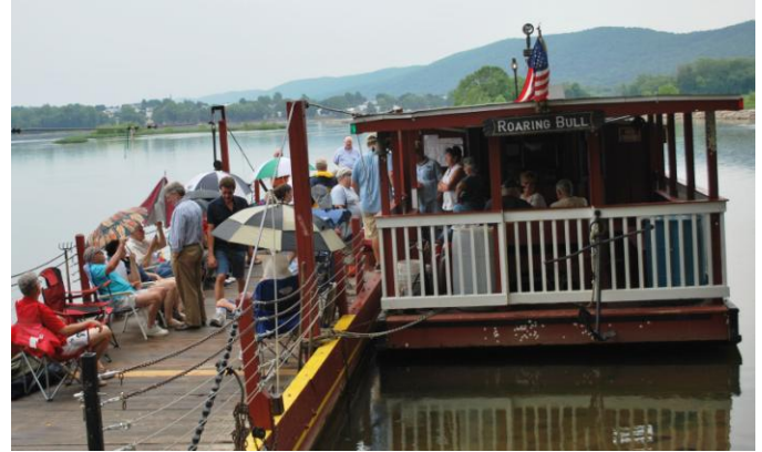
All aboard the Roaring Bull Ferryboat for a Susquehanna River Picnic Cruise! The boat was chartered by the Grange for an evening in July.