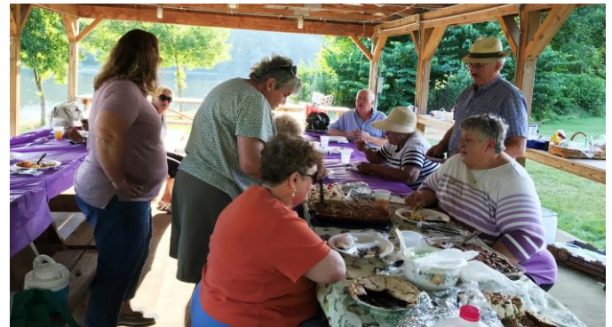
Everyone who attended the picnic enjoyed the food and fellowship despite the heat. Some canine and feline visitors attended the event with their owners.