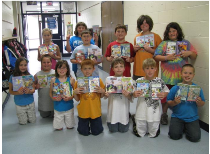
Several hundred children in and around Millerstown & Newport have received free books purchased with $500 provided by the Grange . The books were distributed through local summer reading programs at the Newport Public Library and the Greenwood School District.

Homemade Soup for the Newport Public Library Bike Ride – Sept. 24th About 50 quarts of assorted homemade soups (chicken corn, beef vegetable and ham bean) have already been made and frozen to feed the many riders who will raise thousands of dollars to support the library. This donation is in addition to our annual purchase of children's books for the library reading program.