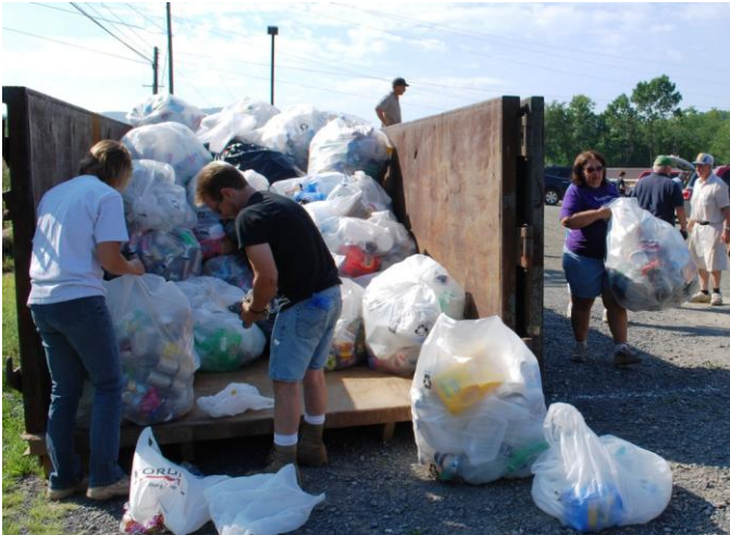
The Grange helped staff the Millerstown Recycling program on the last Saturday of July and then provided a free breakfast at the Grange Hall to all the volunteers.