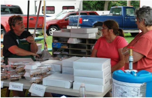
Part of the Grange's responsibility for the Lodge steak dinner stand at the Perry County Fair was the baking and serving of homemade pie – about 100 pies were consumed during the week. Proceeds were shared between the two organizations.