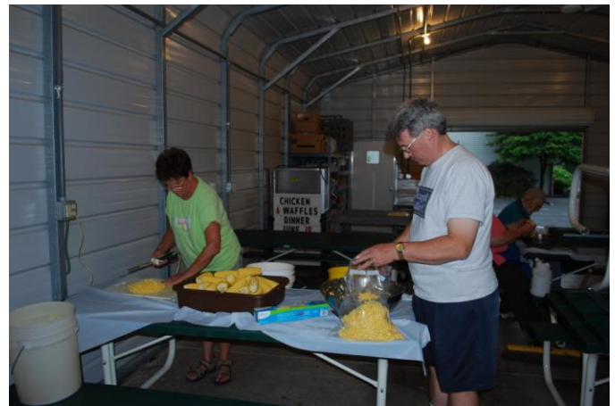
Finally the corn is ready to be bagged for freezing

Rained Out! The planned picnic cruise on the Millersburg Ferry in July was the victim of one of this summer's frequent storms. The venue was quickly changed to the Grange Hall Conference Room and about 25 people enjoyed a meal together followed by conversation and some table games planned by Peg Bolton.