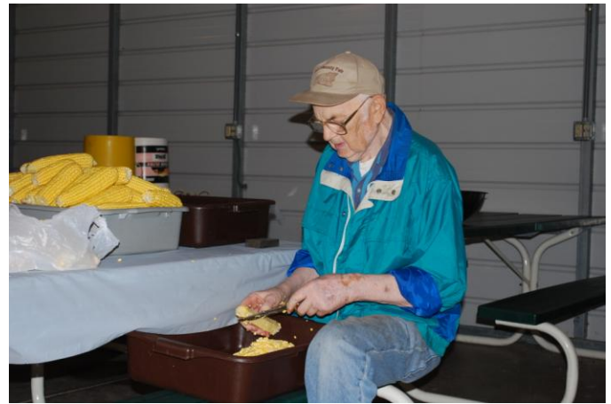
Cutting and scraping the ears...