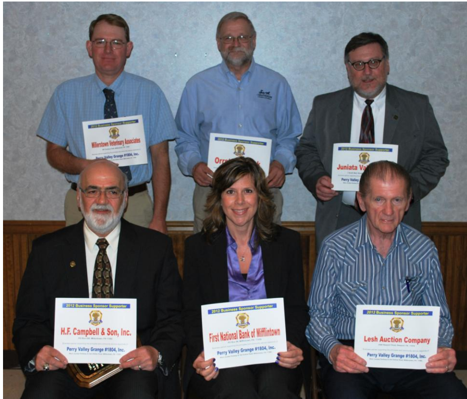
The Grange's 2012 Business Sponsors were introduced during the program, given an opportunity to highlight their services and presented with certificates for display.