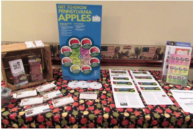
This colorful display and free apples for everyone present were courtesy of the PA Apple Marketing Board.