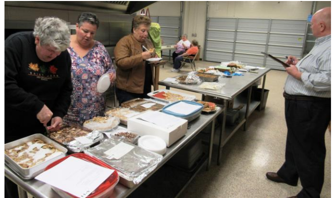
Meanwhile, the judges of the evening were busy sampling all of the entries in the Apple Dessert Contest.