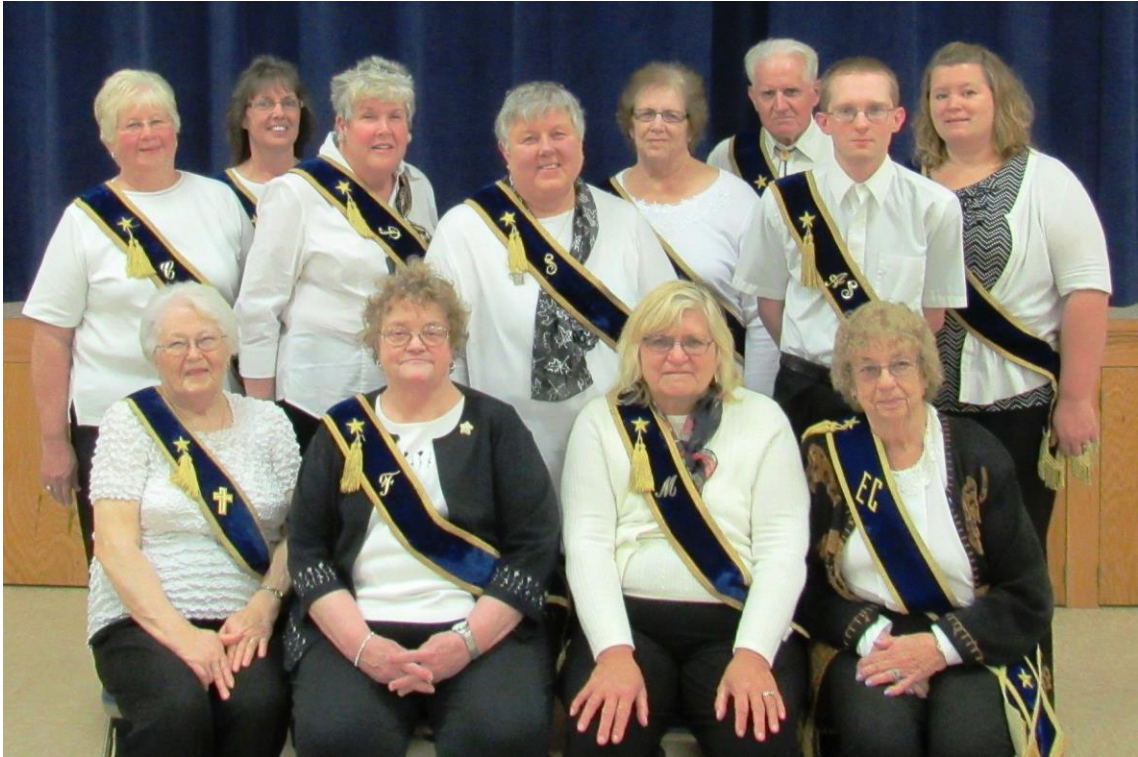
2017-2018 Perry Valley Grange Officers