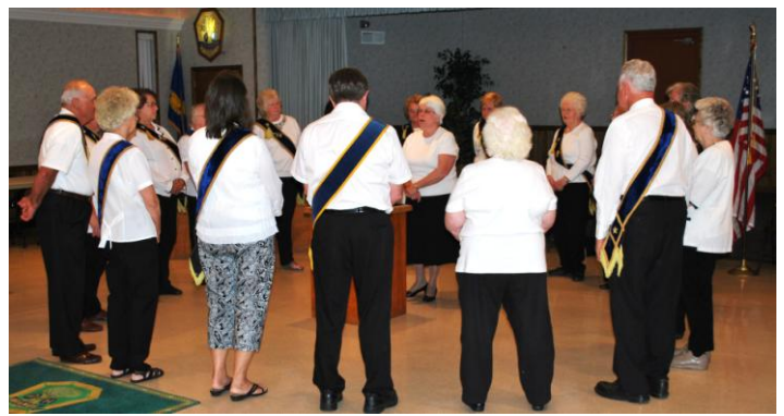
Newly installed officers receive their final instruction in the duties of their positions.