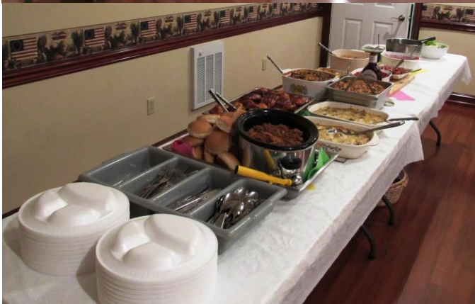
About 50 members and guests of enjoyed a bountiful fellowship dinner and the beautifully decorated tables.