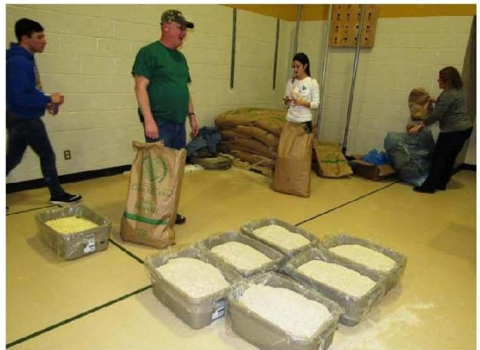
Huge bags of rice and macaroni, supplemented with flavorings and nutrients, were among the ingredients that by the end of the evening would be assembled into 46,000 individual meal kits.

Total receipts were $17,450, contributed by fifty-one individuals and organizations and including the proceeds of several fund raising events. After purchasing all the needed supplies, there was still $5,000 remaining that was given to the Food Banks to underwrite their on-going costs of operation.