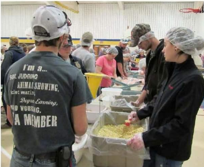
Multiple assembly lines were set up in the Greenwood Elementary School gym. Everyone was assigned one task in the assembly of each meal kit and it was amazing how quickly each was done.