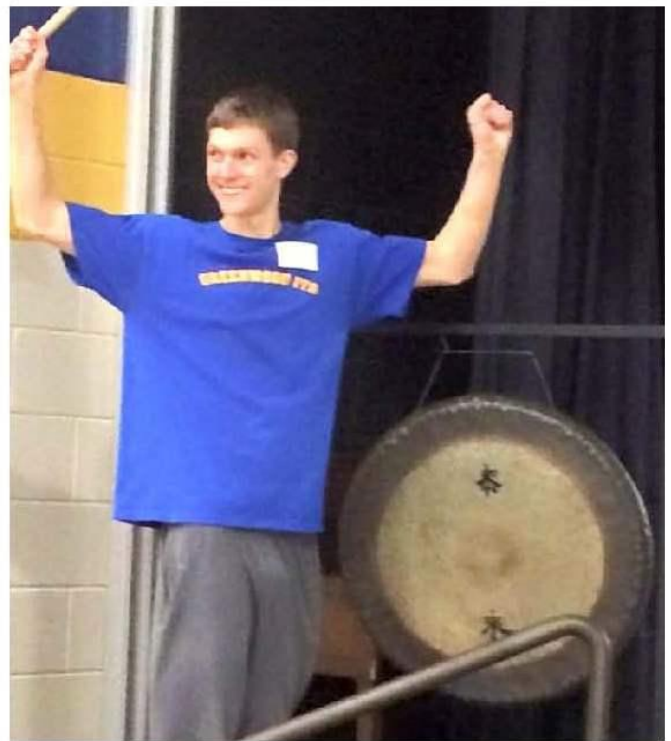
Each time another thousand kits were completed, the gong sounded and applause erupted.