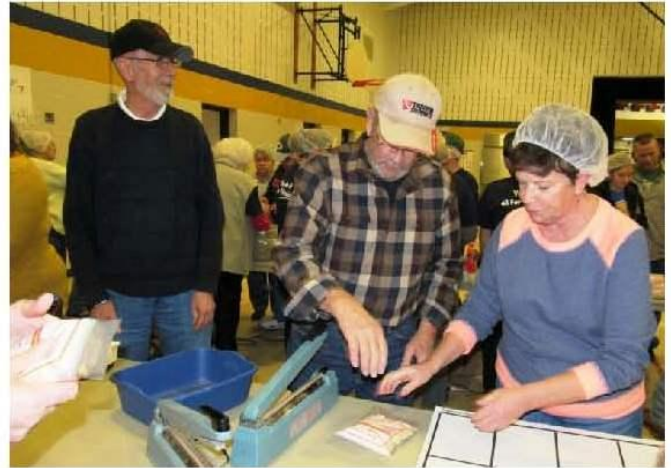
When kits were completed, another group of volunteers used a template to make sure that the correct number was packed into each case.