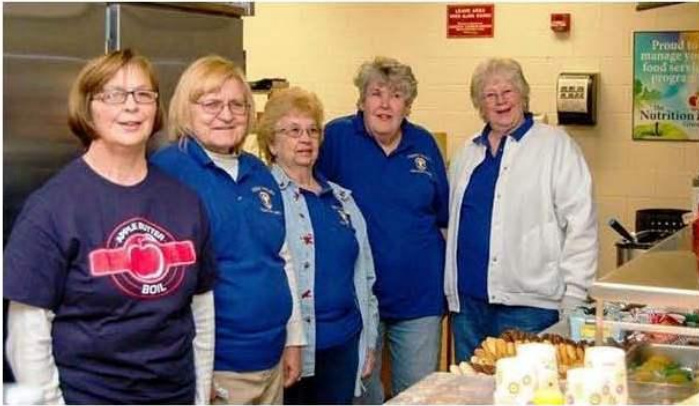
At the mid-way point of the packing operation, a light supper was provided to all helpers thanks to the efforts of these Grange volunteers.