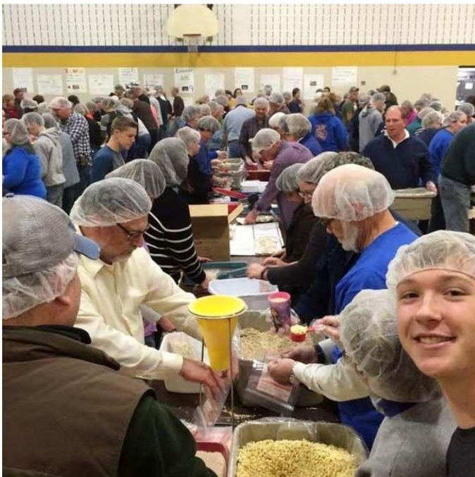
An estimated 180 persons came out on Feb. 5 th to help pack the meal kits. How wonderful to see young and old working and laughing together in such a good cause – feeding the hungry.

The results were beyond expectations and will be further explained in the captions under the pictures taken at the event.