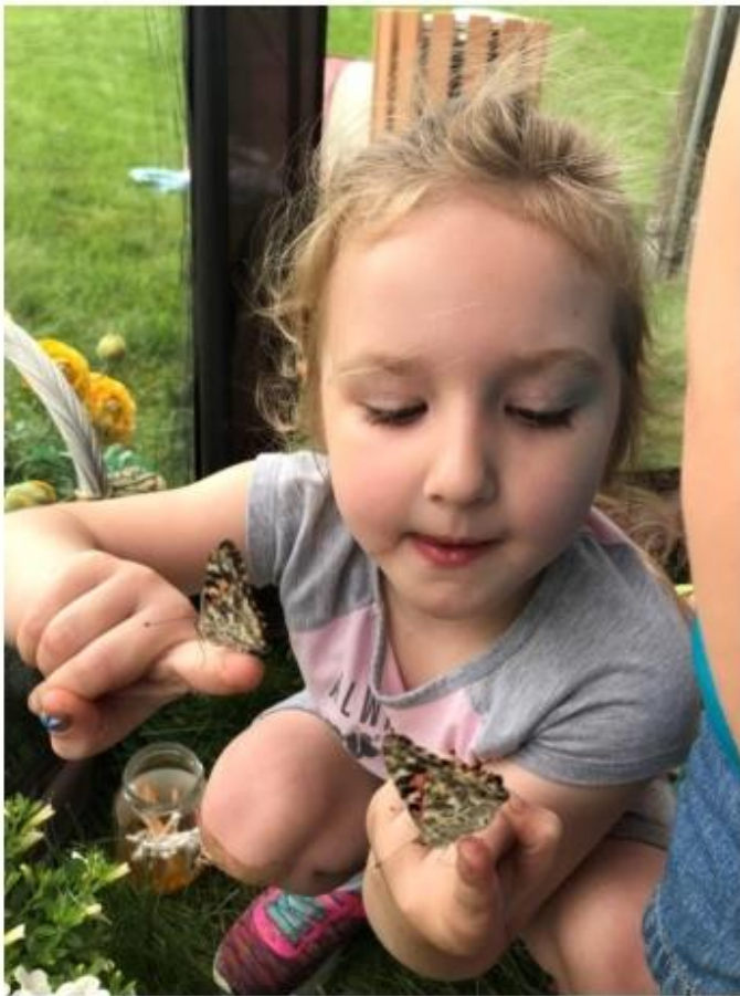
The butterflies fluttering around to the delight of the children were purchased in the chrysalis stage and nurtured carefully for many weeks so they would emerge at just exactly the right time.