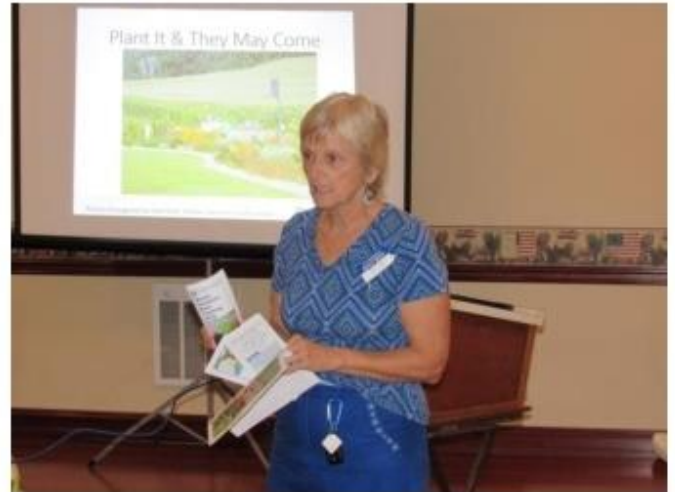
This Master Gardener discussed planting a pollinator garden at May Grange meeting.