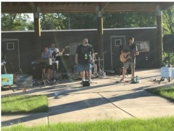
“The Unusual Guests”, a 5-piece acoustical band, played music of the last five decades.