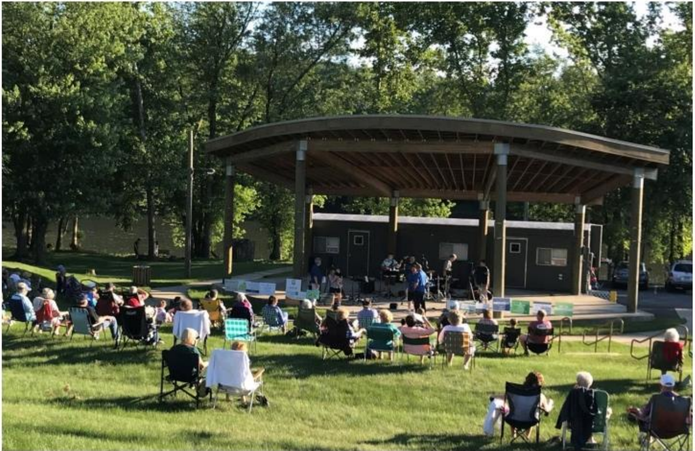
About 150 people came out on a beautiful clear cool June evening for the first of two free concerts provided by the Grange and its 14 Business Sponsors at the Millerstown Community Park outdoor amphitheater along the Juniata River. The second concert of the summer will be July 24 th .