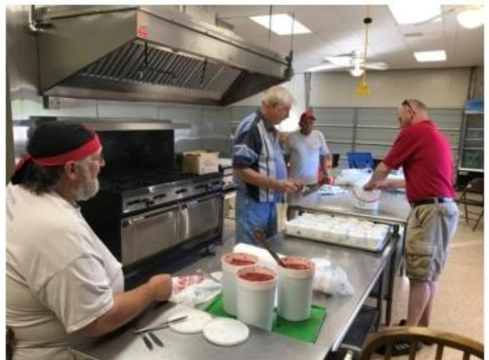
Free refreshments – strawberry sundaes – were provided by the Newport Masonic Lodge.