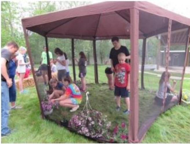
The butterfly house was an especially popular new attraction at this year's Ag Day.