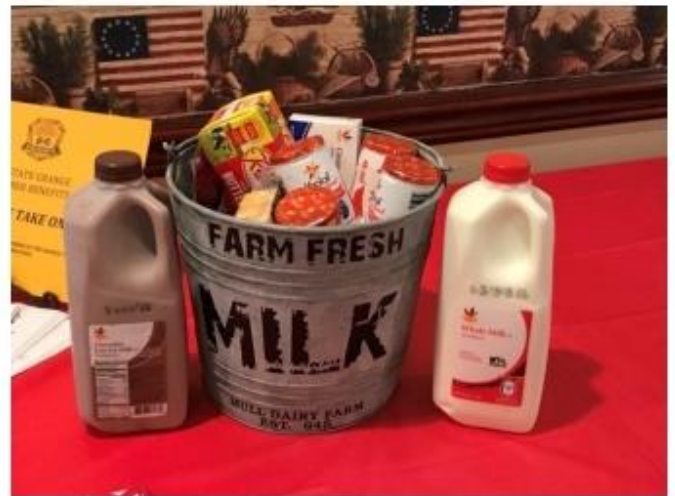
The wholesome, healthful goodness of real dairy products were promoted at our June meeting with a very enlightening program on the current dairy industry crisis.