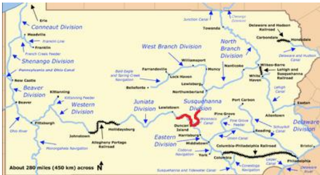
The red highlights in the map of the PA canal system above shows the confluence of the Susquehanna and Juniata Divisions in the area of Perry County, topic of a July 14 th program.

In 1826 the Commonwealth of Pennsylvania began an undertaking that would drastically affect transportation and the development of the state. Constructed between 1826 and 1834, the state-owned Main Line Canal was the first transportation system to directly link Philadelphia and Pittsburgh, decreasing the travel time between the two cities from 23 days to 4-1/2 days. Eventually the canal system would be expanded and for the next 70 years would move people and products along Pennsylvania's waterways. By 1900, however, the growth of railroads spelled the end the canal as a commercial adventure.