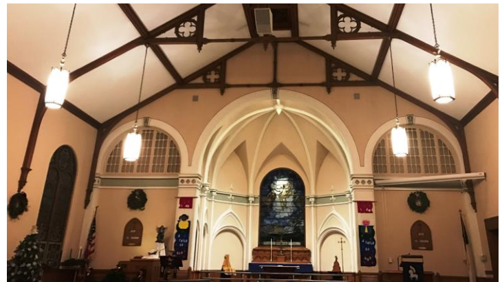
The Grangers found warmth and seasonal music at an organ recital held inside this beautiful church.