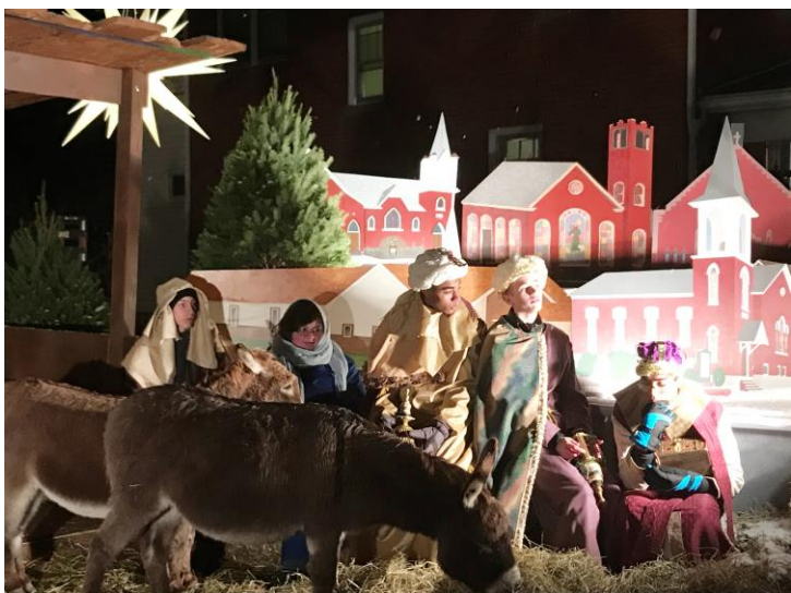
Musical programs were offered throughout the 3-day event. Street entertainers circulated among the crowds and some groups performed on an outdoor stage. This group of youth and live animals portrayed the Nativity.