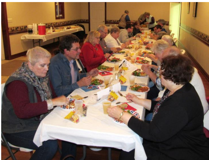
Members/guests enjoyed the fellowship dinner.