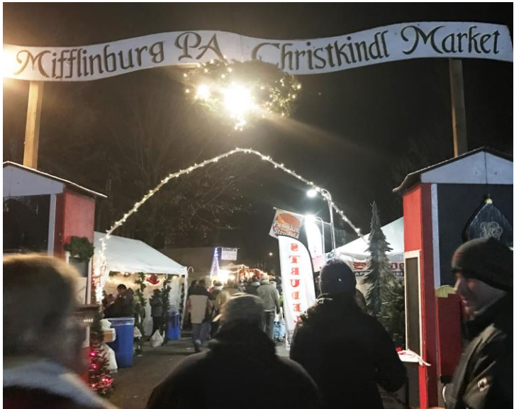
Vendors lining the streets offered all kinds of crafts, foods and drinks.

A small but enthusiastic group of Grangers and friends braved a very cold and slightly snowy evening in December to visit the Christkindl Market in Mifflinburg. Known as one of the nation's best outdoor holiday markets, the streets of this small Union County town were aglow with lights, filled with pleasant aromas and alive with the sounds of Christmas.