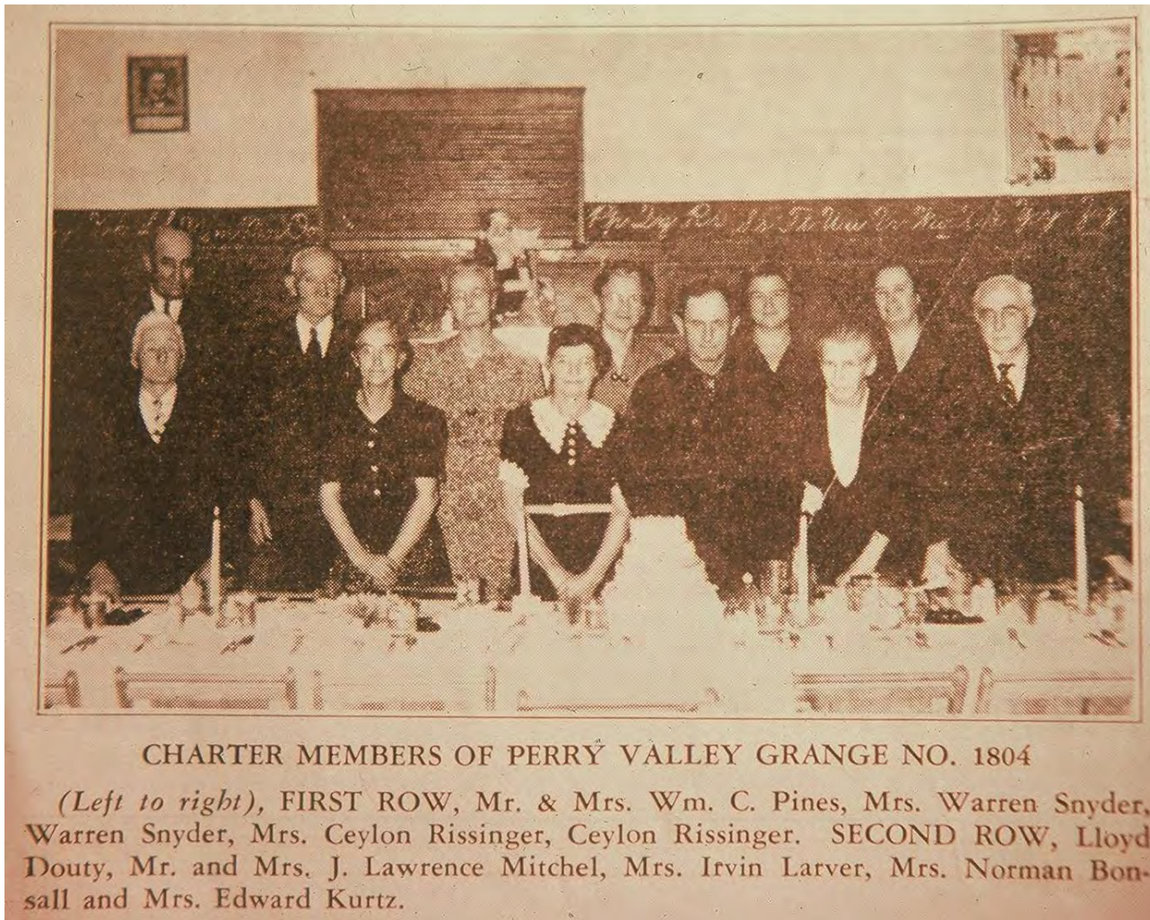
CHARTER MEMBERS OF PERRY VALLEY GRANGE NO. 1804